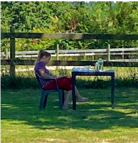
First visit, writing her script in July