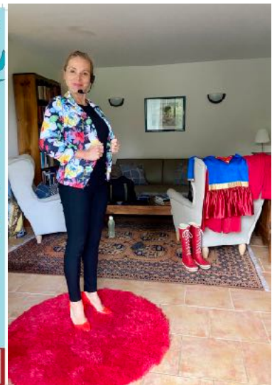
Rehearsal at La Pommeraiie