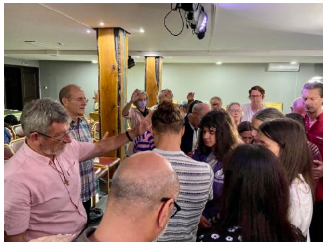
Conference in Bulgaria: Concert and then prayer for Bulgarian Christian artists